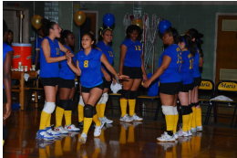
The starting line-up being announced at a Volleyball game.

Monday, June 28–Thursday, July 1, 1:30–3:30pm. Learn the fundamentals of volleyball including passing, serving, spiking, setting, and serve receive. There will be mini tournaments, scrim-