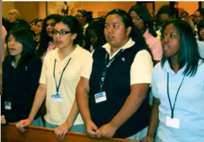
The music and liturgical dance was a blend of Spanish, African and English selections that represented Maria's diverse community today.