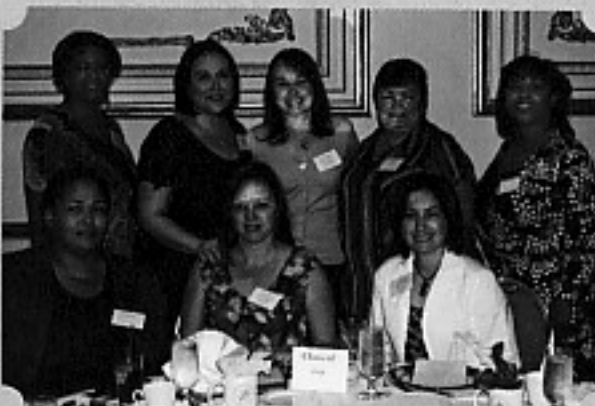
Every class had stories to share!