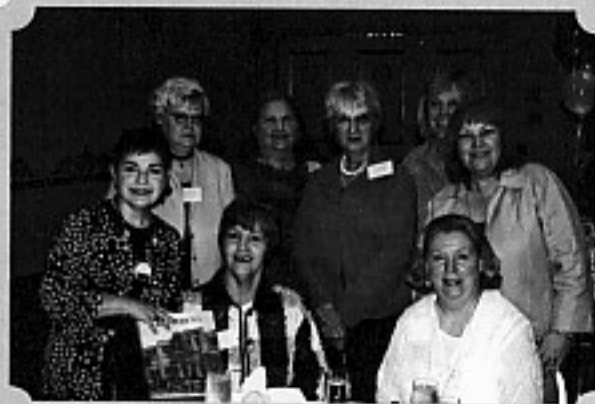
Class of 1954 gather around their class yearbook.